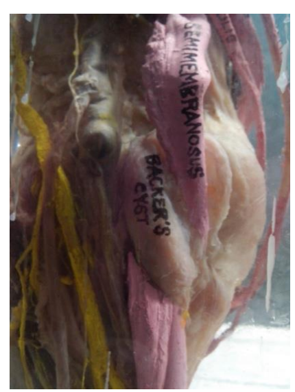
Fig 3: Baker's Cyst encircling semimembranosus