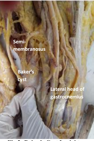
Fig 2: Baker's Cyst In right popliteal region